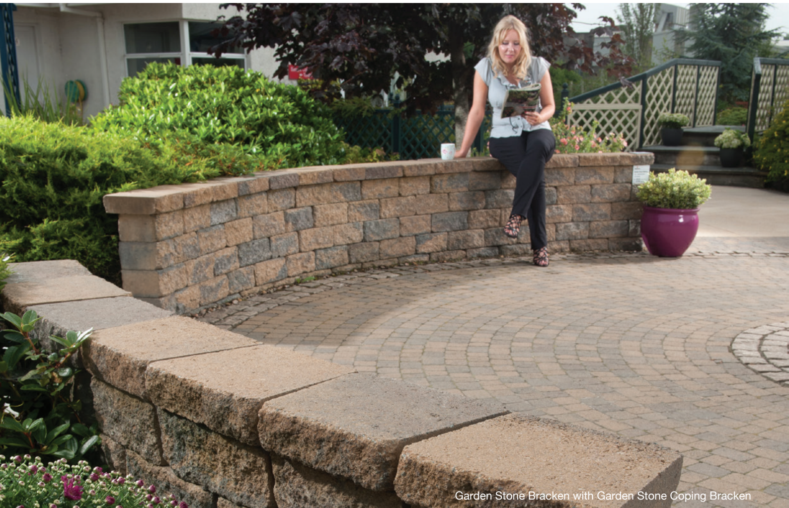
Garden Stone Bracken with Garden Stone Coping Bracken

Garden Stone is a tapered block and is faced on both sides which makes it ideal for creating curved features, planters or for separating areas within the garden. Garden Stone is an ideal DIY walling product which is mortar-free and therefore can be installed quickly with unskilled labour. The blocks are simply glued together and the joints do not require pointing.